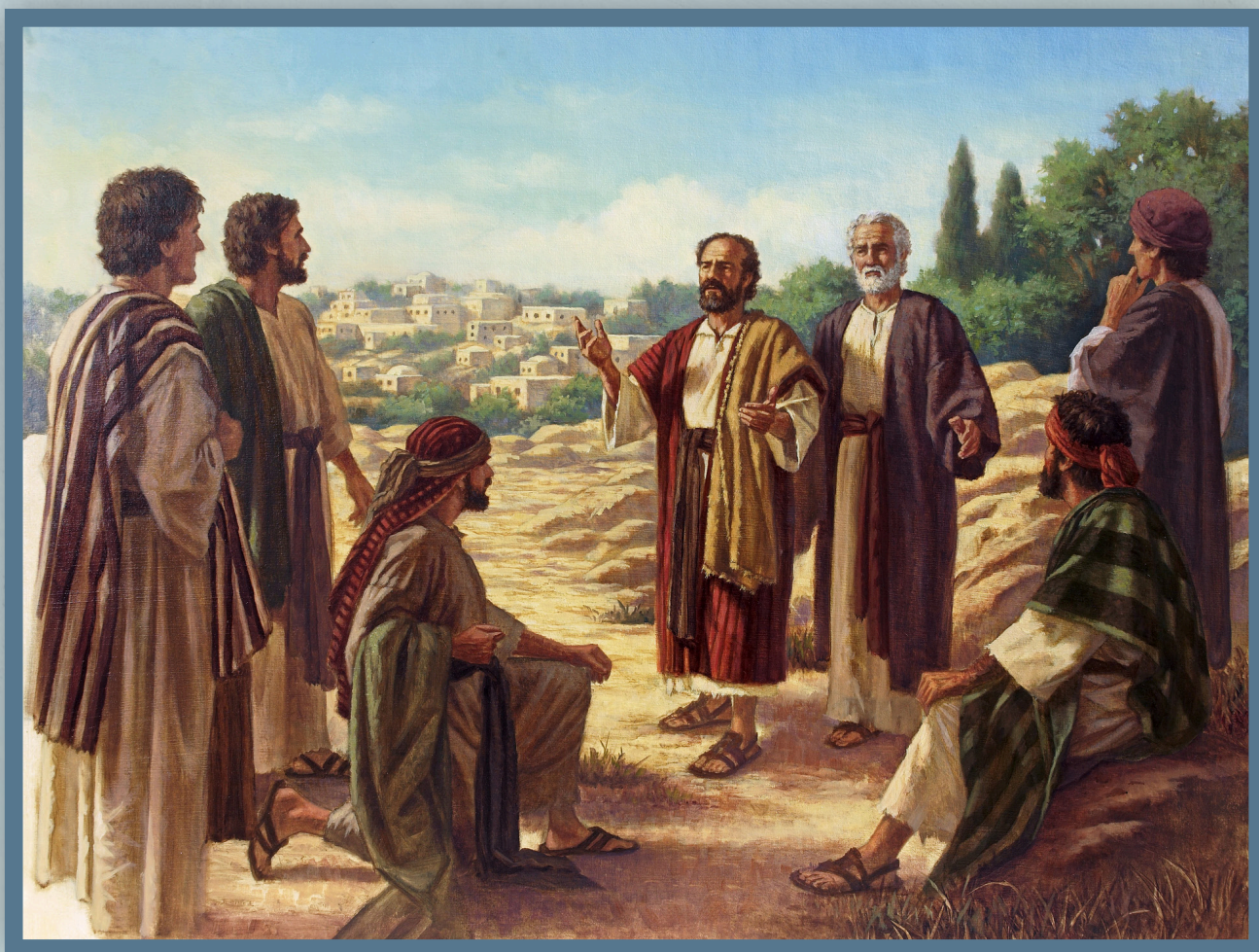
Paul and Barnabas Told About Jesus

Opposition followed right on their heels. The Jewish leaders were so angry that they stirred up the chief men and women of the city and accused Paul of blasphemy. They persecuted the missionaries and cast them out of their coasts. Paul and his company shook off the dust of their feet against them and left. They came to Iconium, a city of antiquity, about eighty miles east. They didn't let their challenges stop them. The scriptures say, "And the disciples were filled with joy, and with the Holy Ghost." [Acts 13:52]