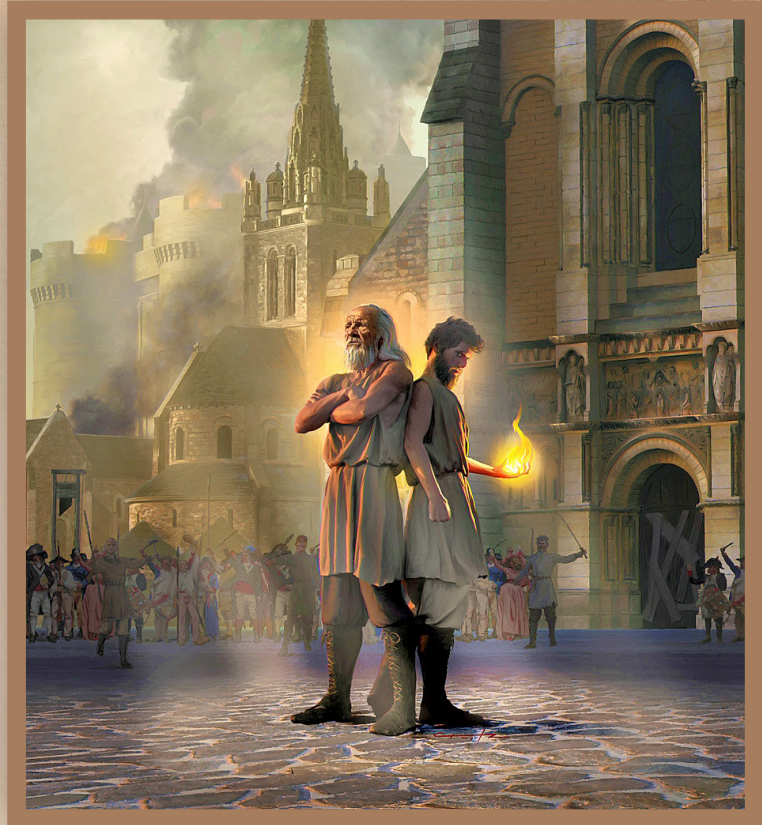
The Two Witnesses

John took the book and ate it up, which is symbolic of his performing his covenant restoration mission to help gather the Lost Ten Tribes of Israel. It was sweet as honey in his mouth, but, as soon as he had eaten it, it was bitter in his belly, symbolizing that his mission to gather Israel would be both joyous and painful. John was translated and would live through all these events he was shown. He was shown his own covenant mission in the last days. The angel said to John, “Thou must prophesy again before many peoples, and nations, and tongues, and kings.” [Revelation 10:11]