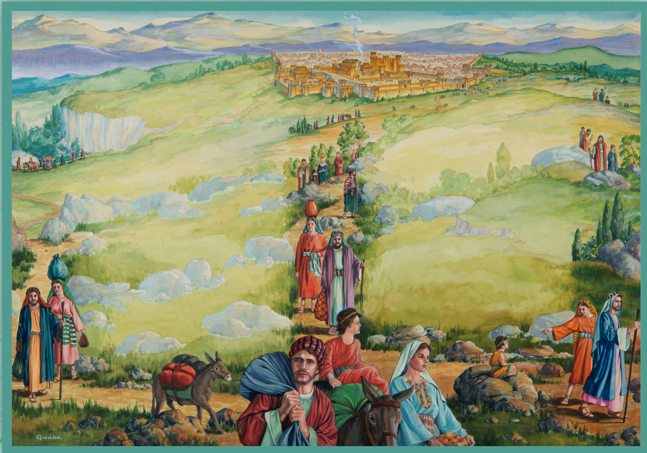
Persecution of the First Christians and They Spread Out

The new covenant gospel of Jesus Christ went forth with great power. Those who were introduced to it in Jerusalem soon carried the message wherever they went. Persecution also caused local members of the Church of Jesus Christ to be scattered, thus taking the new covenant gospel with them to the Gentiles.