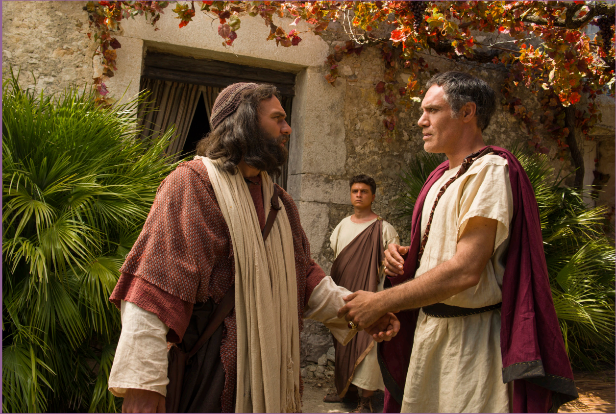
Cornelius Greets Peter

preaching peace by Jesus Christ: (He is Lord of all:) That word, I say, ye know, which was published throughout all Judea, and began from Galilee, after the baptism which John preached; how God anointed Jesus of Nazareth with the Holy Ghost and with power: who went about doing good, and healing all that were oppressed of the devil; for God was with Him. And we are witnesses of all things which He did both in the land of the Jews, and in Jerusalem; whom they slew and hanged on a tree:”