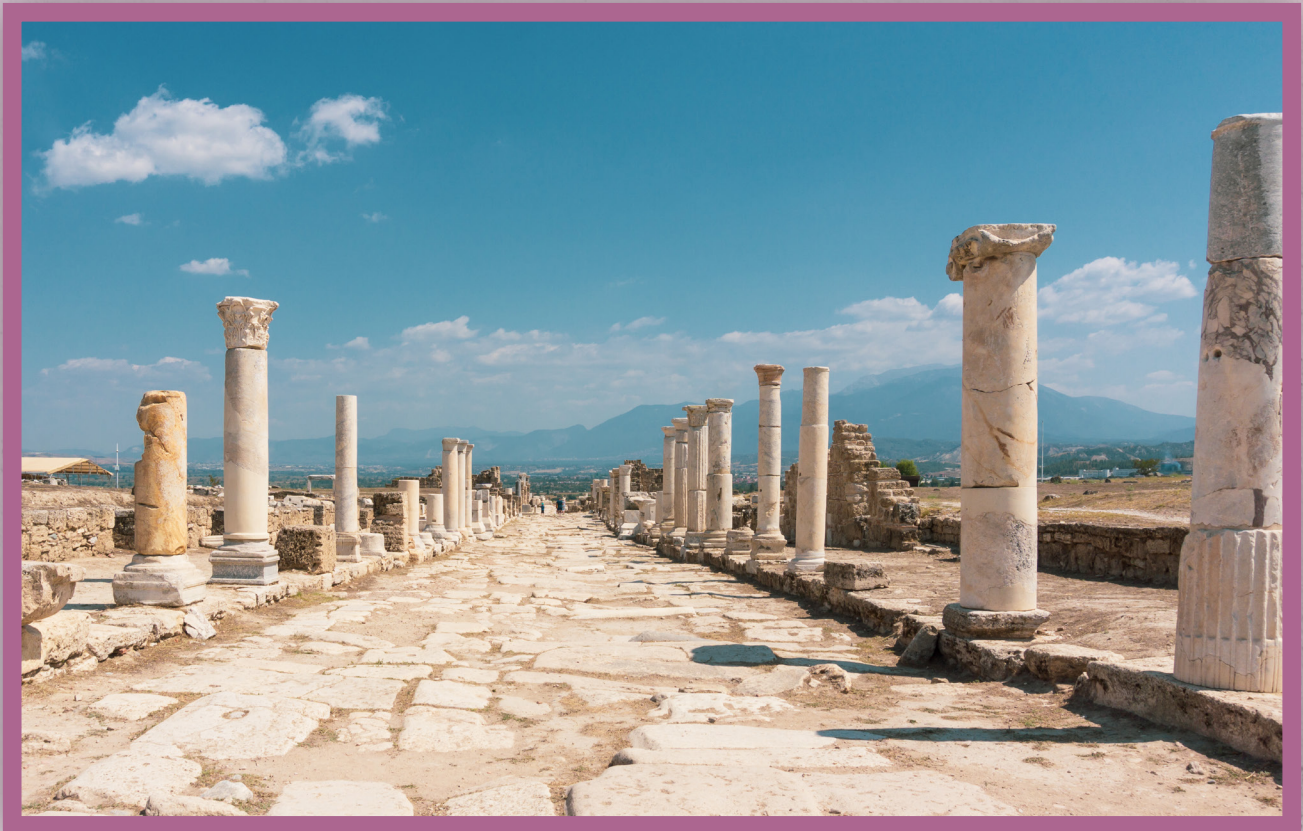
Colossae-road Trade Route that ran Between Laodicea and Hierapolis

Colossae was an ancient city in the Roman Province of Asia (modern-day Turkey). It was about one hundred miles east of Ephesus. Before Paul's time, Colossae was on the great highway of trade between the East and West of the ancient world but had since declined and become a small town.