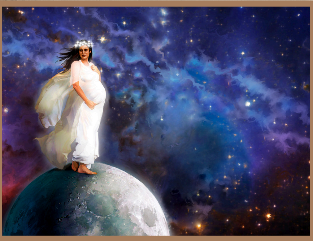
Woman of Revelation Twelve - God's Church

John saw a woman (symbolic of the Church of God) “clothed with the sun” and the “moon under her feet.” There was a “crown of twelve stars” on her head. The woman was “with child” and cried, “travailing in birth, and pained to be delivered.” She “brought forth a man child” who was to “rule all nations with a rod of iron,” and “her child was caught up unto God and His throne.” [JST, Revelation 12:1-2,5] The woman symbolized the Church, the man child symbolized the Kingdom of God on earth and the rod of iron may have symbolized the priesthood.