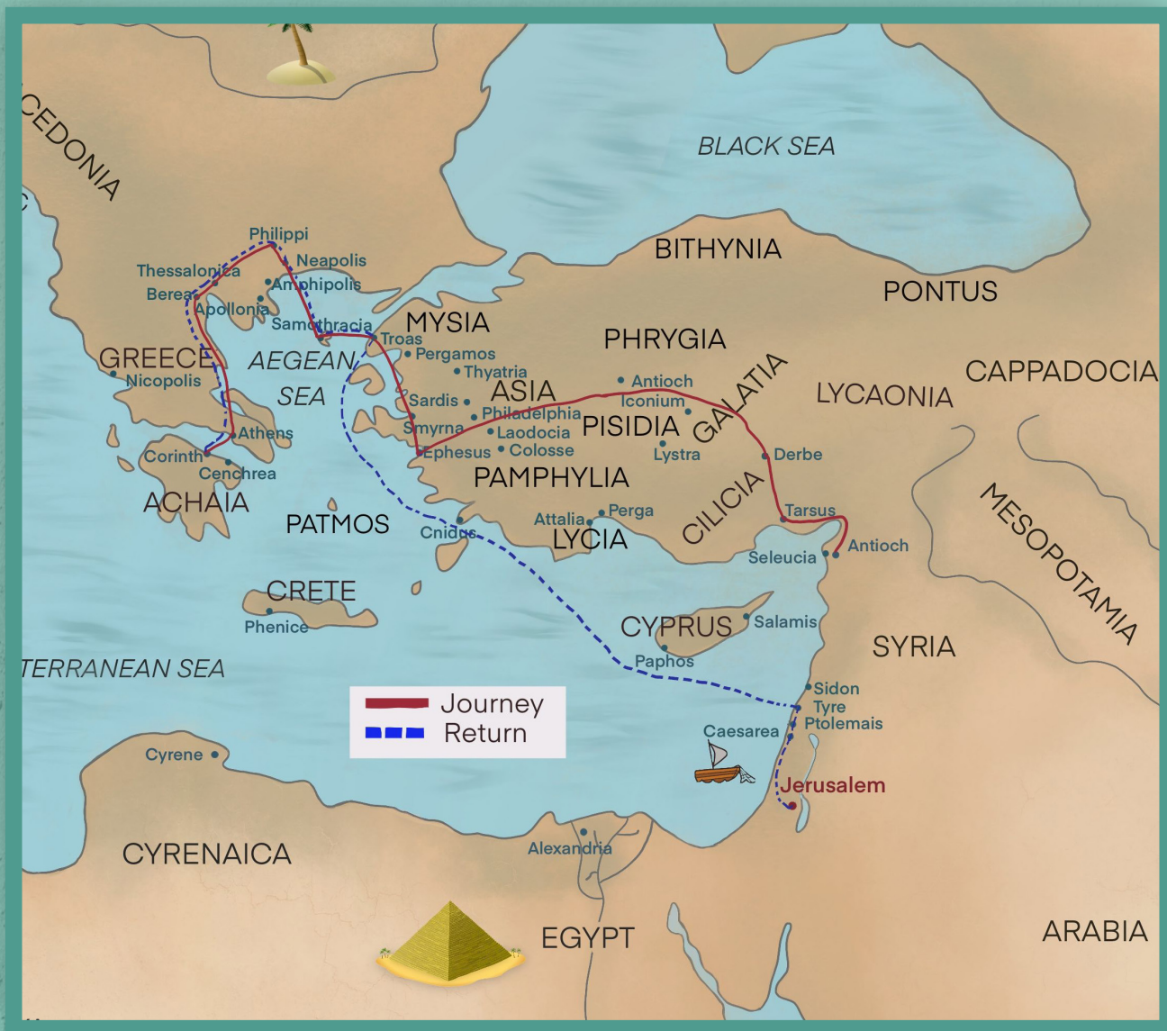
Map of Paul's Third Missionary Journey

Paul's third missionary journey was the longest in duration and distance. He traveled over 3,500 miles and was gone for almost 4 years. Of course, he re-visited and strengthened congregations of the Church of Jesus Christ that he had established on prior missions. He also established additional branches of the Church in new areas. Paul was a diligent servant of Jesus Christ and became a great writer and preacher. His influence grew tremendously. One of his most important tasks was to collect more donations for the poor to take back to Jerusalem.