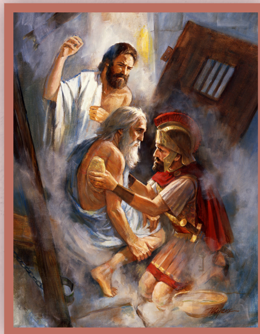
The Jailor Who Was Saved

Paul cried out to him in a loud voice, saying, “ Do thyself no harm: for we are all here. ” [Acts 16:28] The jailor called for a light, came in trembling and fell down before Paul and Silas, saying, “ Sirs, what must I do to be saved? ” They said to him, “ Believe on the Lord Jesus Christ, and thou shalt be saved, and thy house. ” [Acts 16:30-31] They then taught him the new covenant gospel of Jesus Christ. He believed and rejoiced. They baptized the jailor and all his household into the Church of Jesus Christ. This jailor brought Paul and Silas into his own house and washed their wounds and fed them.