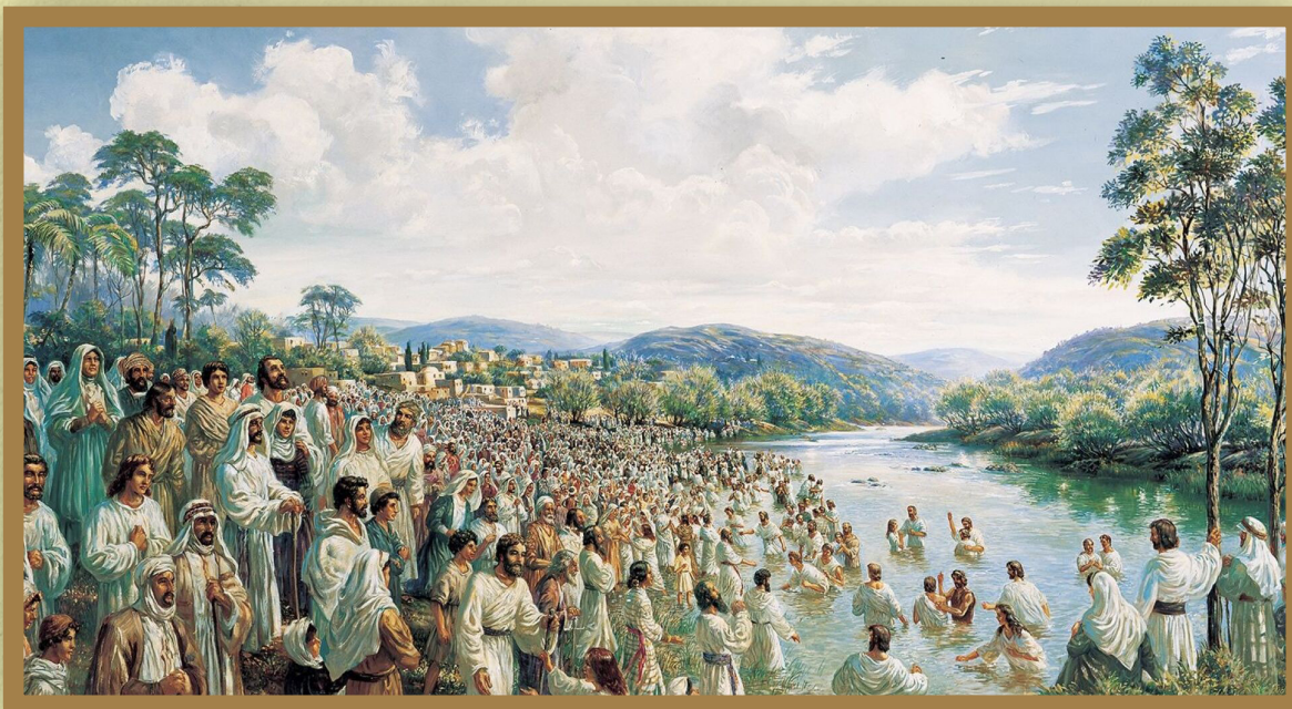
Day of Pentecost, by Sidney King, © By Intellectual Reserve, Inc.

In this crowd were probably some of the earnest followers of Jesus as well as those who had opposed Him and even participated in seeking His crucifixion. They all learned that the death of Jesus Christ was part of God’s covenant plan and that they could all be forgiven of their sins if they repented. The response was incredible! About three thousand souls gladly received the new covenant gospel and were baptized that same day.