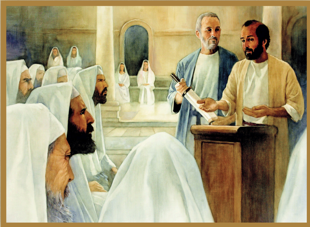
Paul and Barnabas Preached

Details of the new covenant gospel of Jesus Christ were revealed piece by piece to His followers and new converts as they were prepared to receive it. While all members of the Church of Jesus Christ had to accept new doctrine, many had to give up old doctrines they held dear. This created opposition that required a great council in Jerusalem to solve. This would change the course of the Church forever!