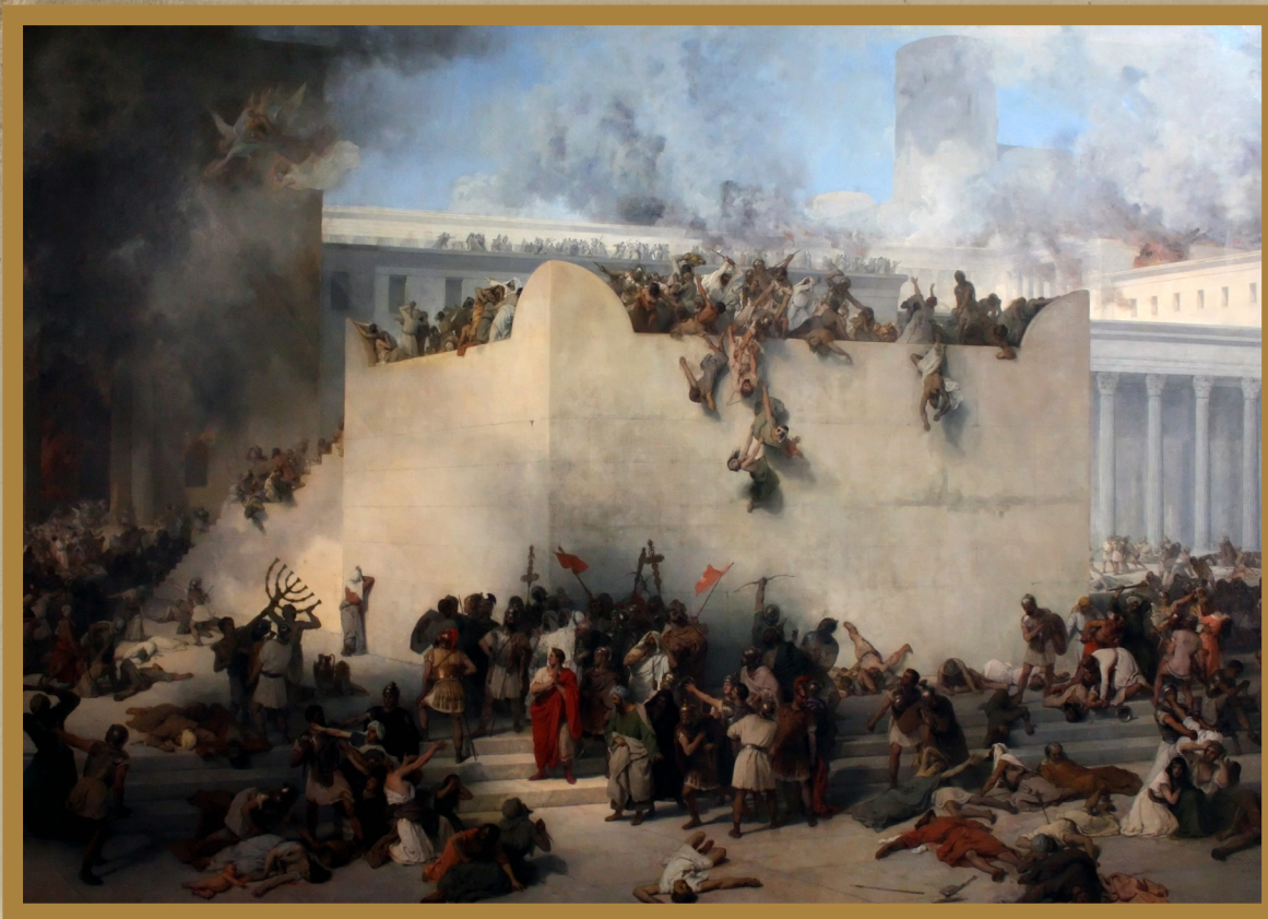
Destruction of the Temple in Jerusalem, by Francesco Hayez

command of the Roman legions in Jerusalem passed to his son, Titus, who also later became the next Roman emperor.